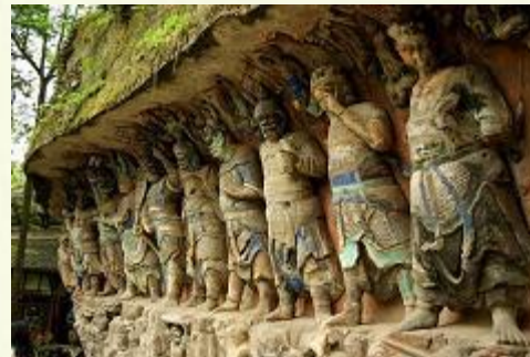
Dazu Rock Carvings