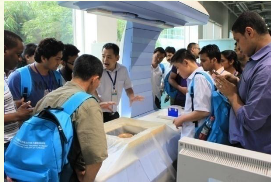
National Engineering Research Centre