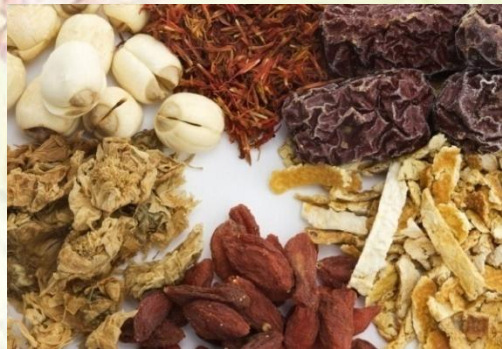
Lab of Chinese Traditional Medicine