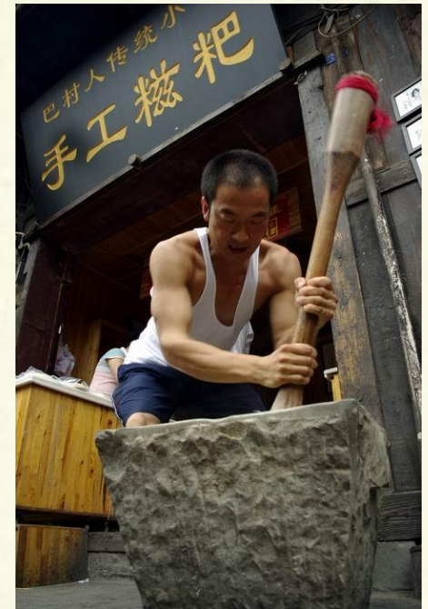
Sticky Rice Pan