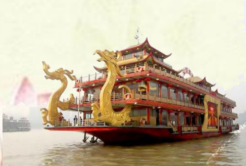
River Trip: Night View